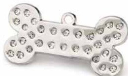
bone bling silver