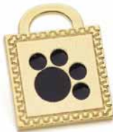
paw stamp gold