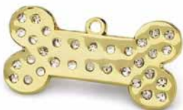
bone bling gold