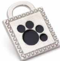
paw stamp silver