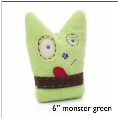
6" monster green