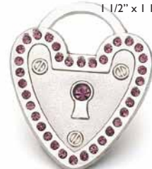
padlock heart silver