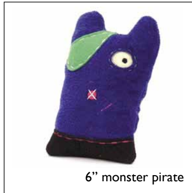
6" monster pirate