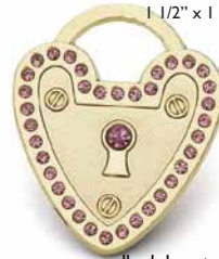
padlock heart gold