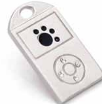
pawd player silver