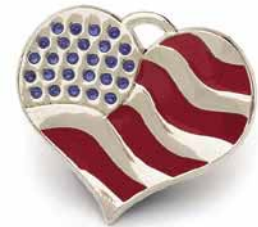
stars and stripes