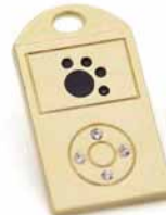
pawd player gold