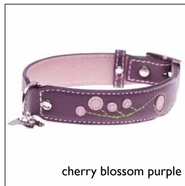
cherry blossom purple