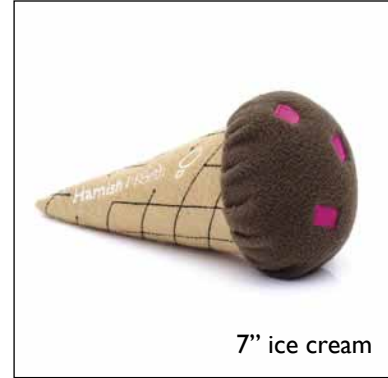
7" ice cream