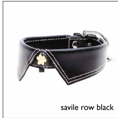
savile row black