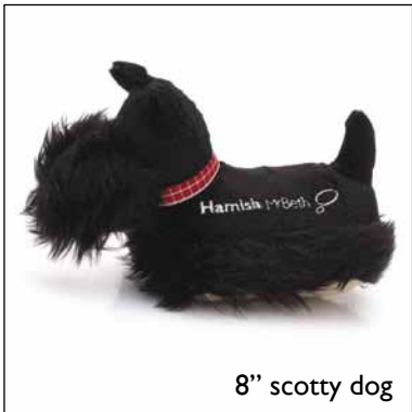
8" scotty dog