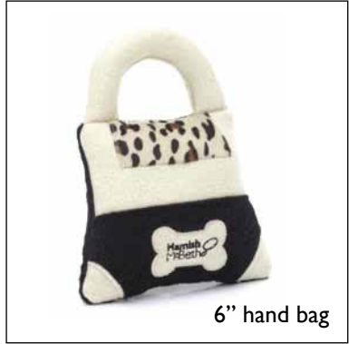
6" hand bag