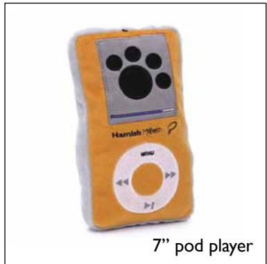
7" pod player