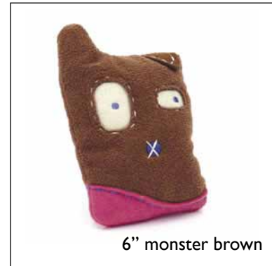
6" monster brown