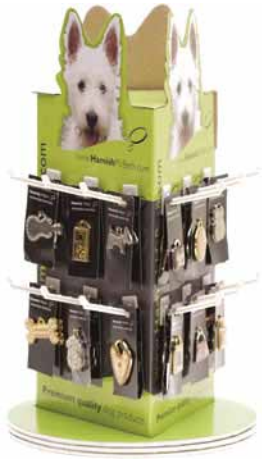
pet charm display - free with order of 40 or more charms.