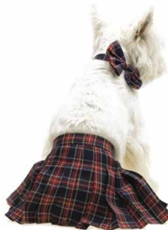
kilt and bow tie set in blue