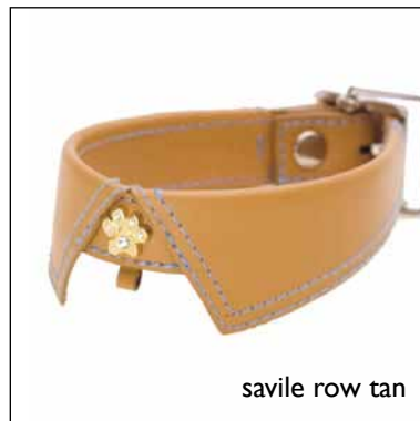
savile row tan