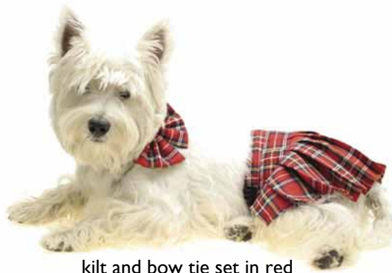
kilt and bow tie set in red