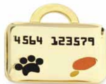
credit card gold